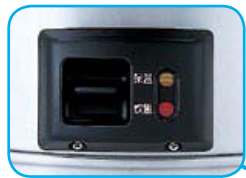
Automatic keep-warm function